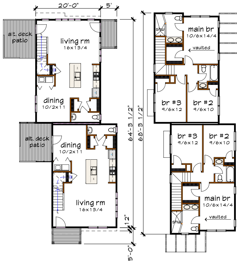
Floor 1 plan